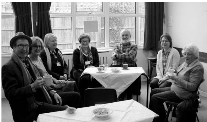
Volunteers enjoying the refreshments

Volunteers listening to the presentations